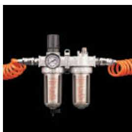
Pneumatic power source 6kg/cm²